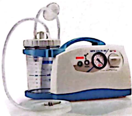
NEW ASKIR 30 PROXIMITY