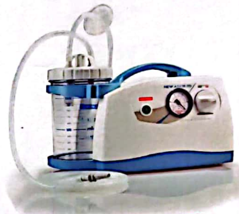
NEW ASKIR 20