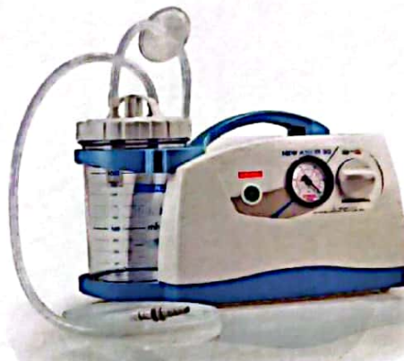
NEW ASKIR 30